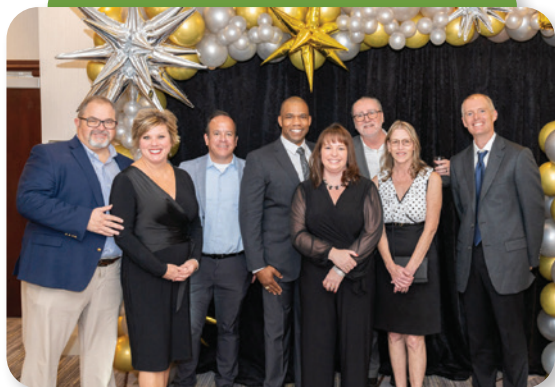
Iowa Academy of Family Physicians Award Dinner Attendees.